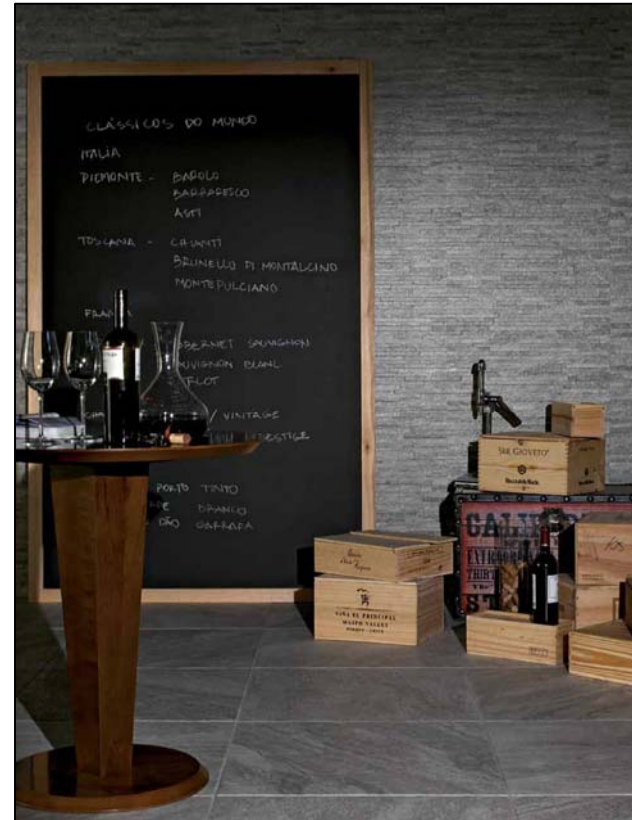
BELLO MOS SLATE ARGENTO shown above as wall tile