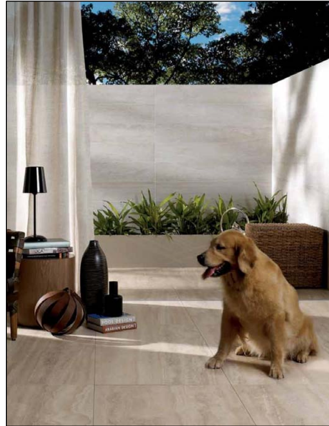
BELLO TRAVERTINO NAVONA BIANCO