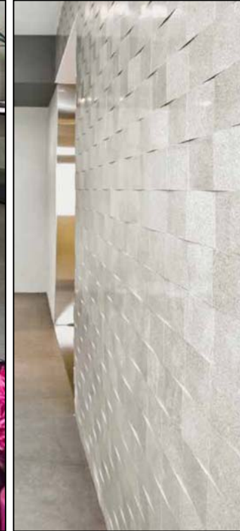
Wall: BRERA GREY Floor: BRERA CHARCOAL