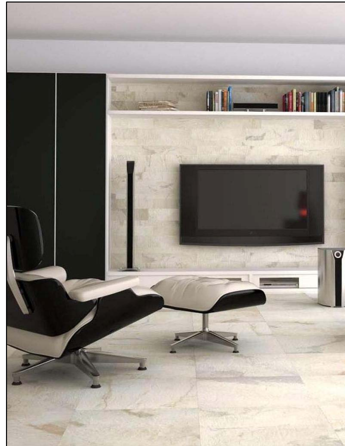
NAT 10 ALASKA shown above

Michigan Design Center 1700 Stutz Drive, Suite 94 Troy, MI, USA 48084 Tel: 248-643-6520 Fax: 248-643-6523