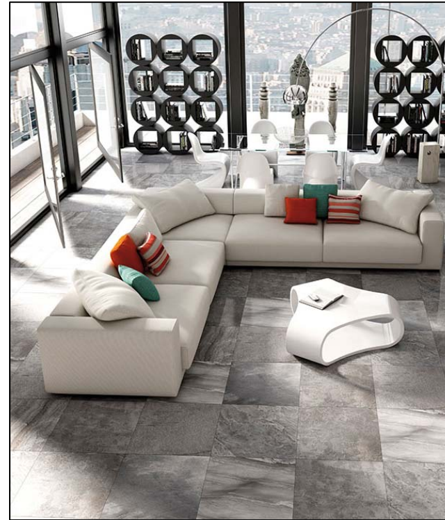
DOVE RHAPSODY 24x24